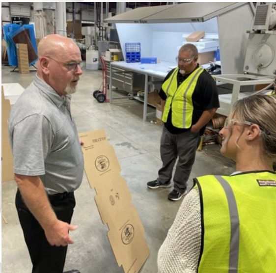
Educators tour McElroy Packaging in Orrville, Ohio during the Vital Connections Program