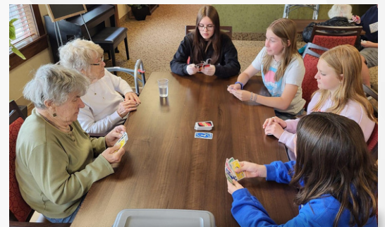
Mapleton Local Schools National Junior Honor Society spends time with the Inn at Ashland Woods residents