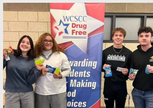
Students at Wayne County Schools Career Center participate in Drug Free Clubs