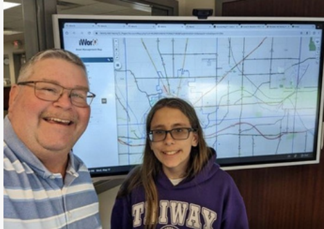
Triway Local Schools Junior High 2023 Career Week