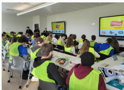
Students participate in a site tour at Frito-Lay during the Wayne County MFG Day Event