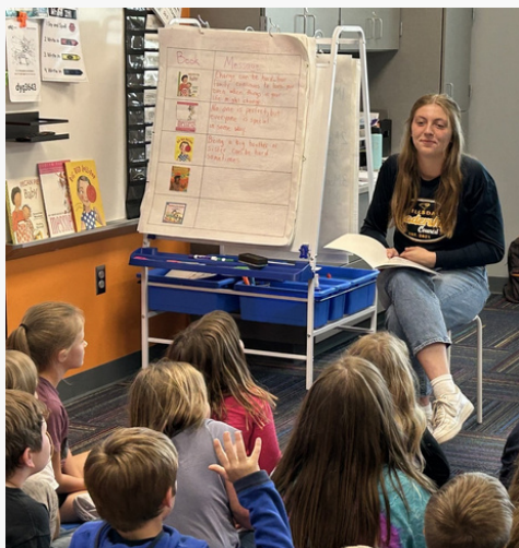
Hillsdale Local Schools Captains' Leadership Council reads stories to 2nd grade students