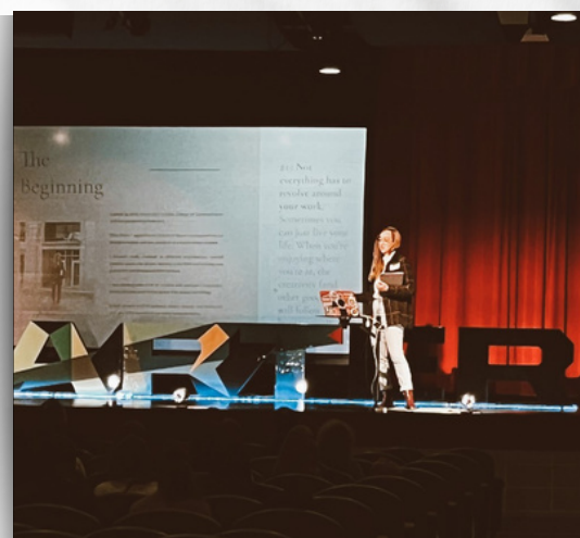
The chARTer event featured a crew of creative professionals and students eager to find their path in creative arts. The chARTer event is a day with keynote speakers, q+a sessions, interactive roundtable discussions, and opportunities for students to speak to college representatives