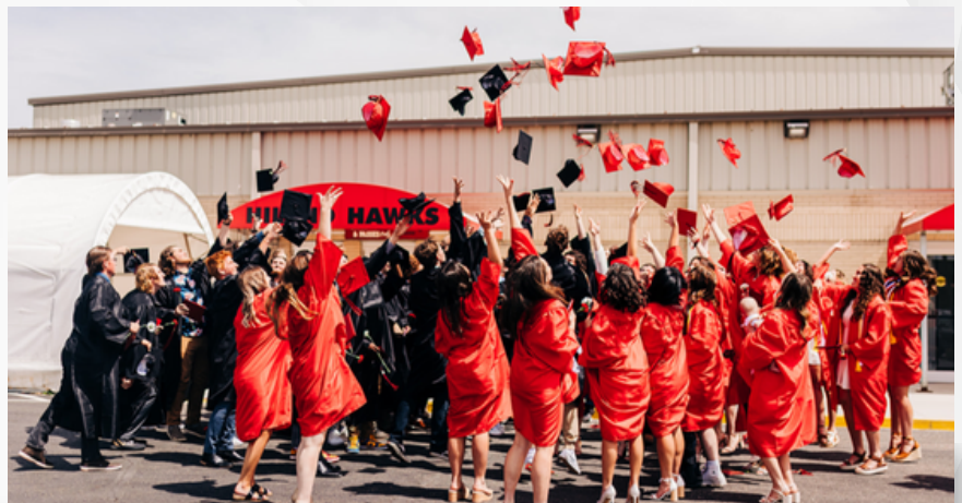
Hiland High School Seniors celebrate their graduation