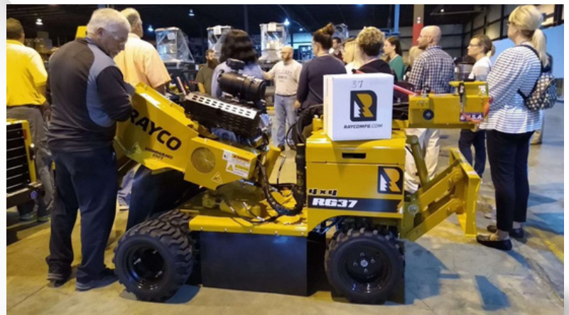
Educators tour Rayco Manufacturing, LLC in Wooster, Ohio during the Vital Connections Program