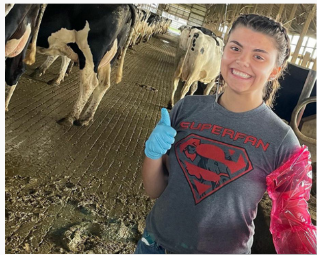
Northwestern Local Schools FFA Student works with cows in the barn