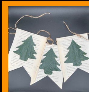
Take It Make It: Tree Banner Kit