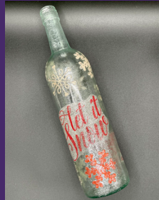
Winter Snow Bottle (See Side 2 for more information.)